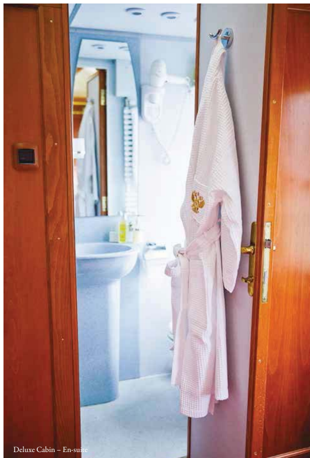
Deluxe Cabin – En-suite