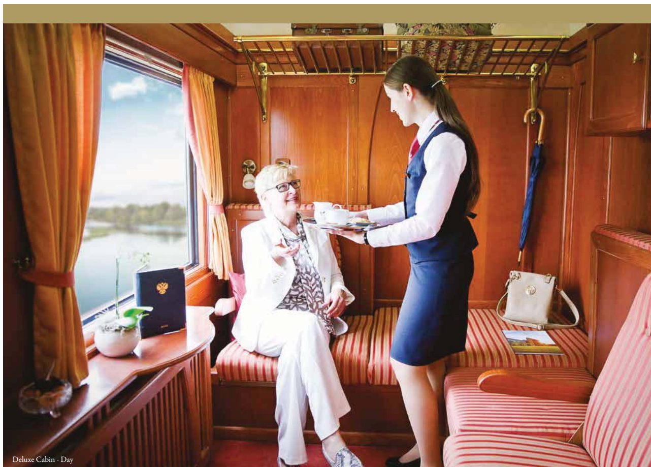
Deluxe Cabin - Day

Travel in some of the finest rail accommodation available in Europe.