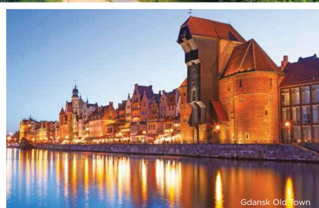
Gdansk Old Town

The coastal region of Poland has an important place in Polish consciousness as a key location at the start of World War Two in September 1939. This is also where the famous Solidarity independent trade union movement started in 1980 for the protection of worker's rights, which later became the symbol of