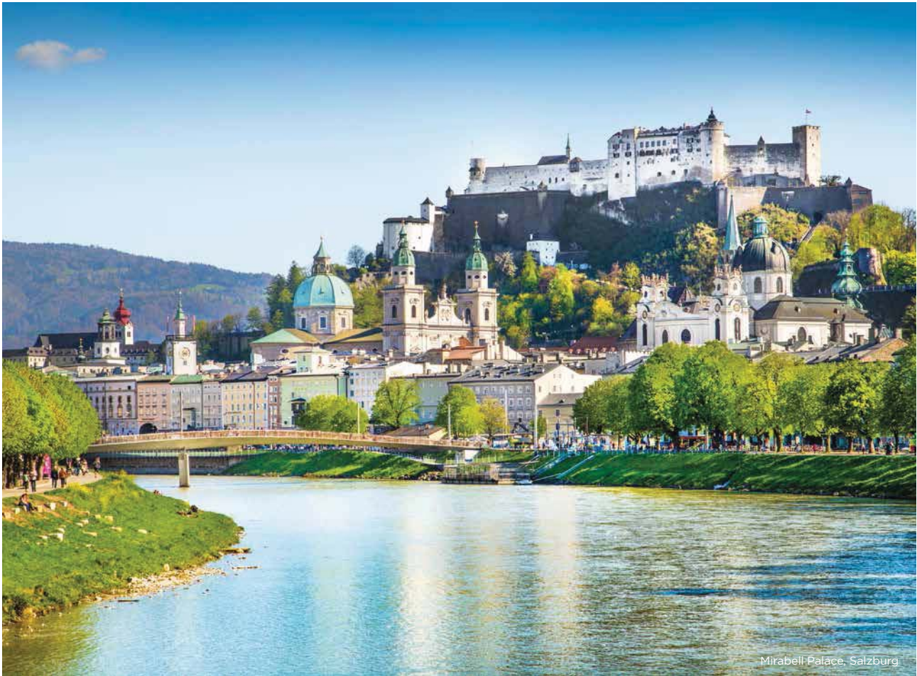
Mirabell Palace, Salzburg