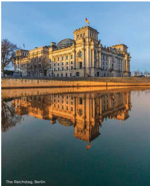
The Reichstag, Berlin

For guests not taking the driving experience option, there will be free time this afternoon with the opportunity to visit the museum of your choice such as the Topography of Terror; or take time for reflection and contemplation at the poignant Memorial to the Murdered Jews of Europe. There will also be time for shopping along the elegant Kurfürstendamm boulevard.