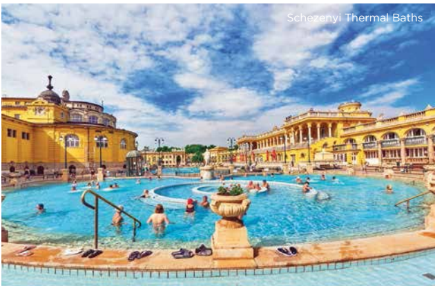
Schezenyi Thermal Baths

On arrivals day in Budapest, you will be met at the airport, train station or river ship landing stage and transferred to the Four Seasons Hotel Gresham Palace or similar for a two-night stay. Enjoy a welcome reception dinner in the elegant surrounds of this art nouveau landmark, with its panoramic views across the River Danube, where you can meet your fellow travellers on this highly-anticipated journey.