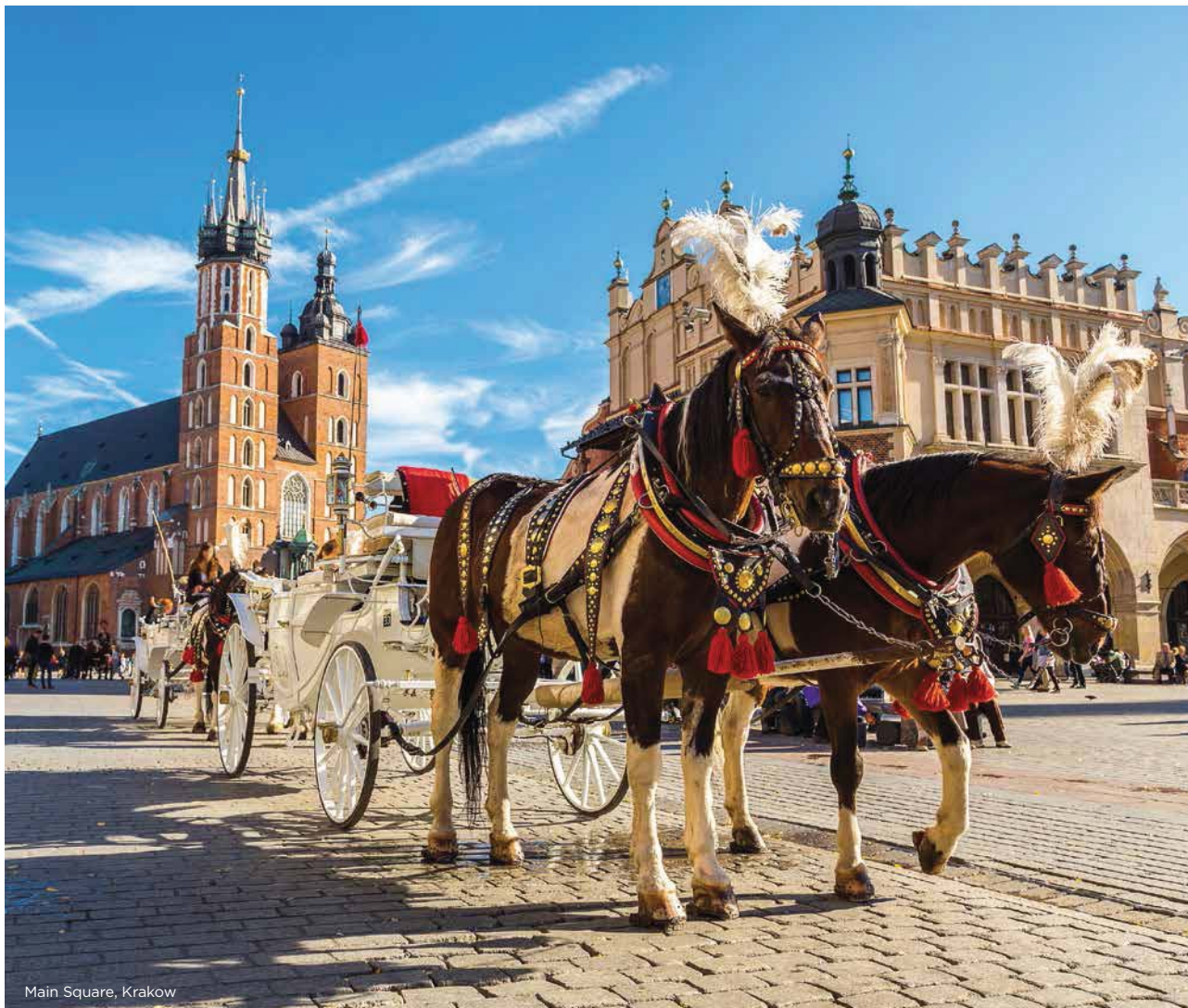
Main Square, Krakow

the beautiful Old Town Square. After lunch we will walk the streets of the Old Town including a visit to Wawel Royal Cathedral, followed by a panoramic tour of the Kazimierz Jewish district.