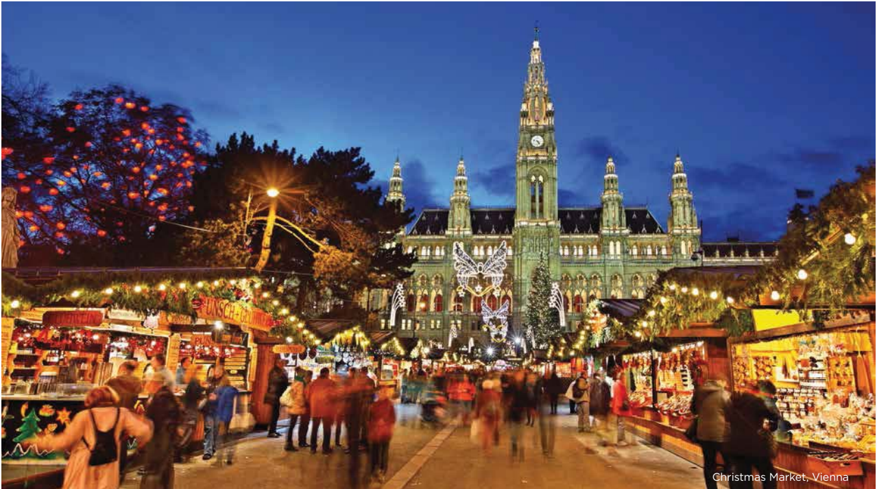
Christmas Market, Vienna