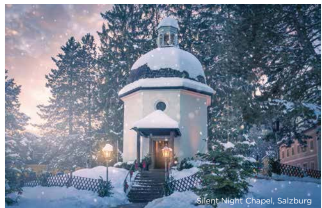
Silent Night Chapel, Salzburg

We return to the train for lunch and from the Restaurant Cars enjoy the spectacular Bavarian scenery as we head across the border into Germany for our final stop in Munich. We stay for 2 nights at a centrally located five-star hotel.