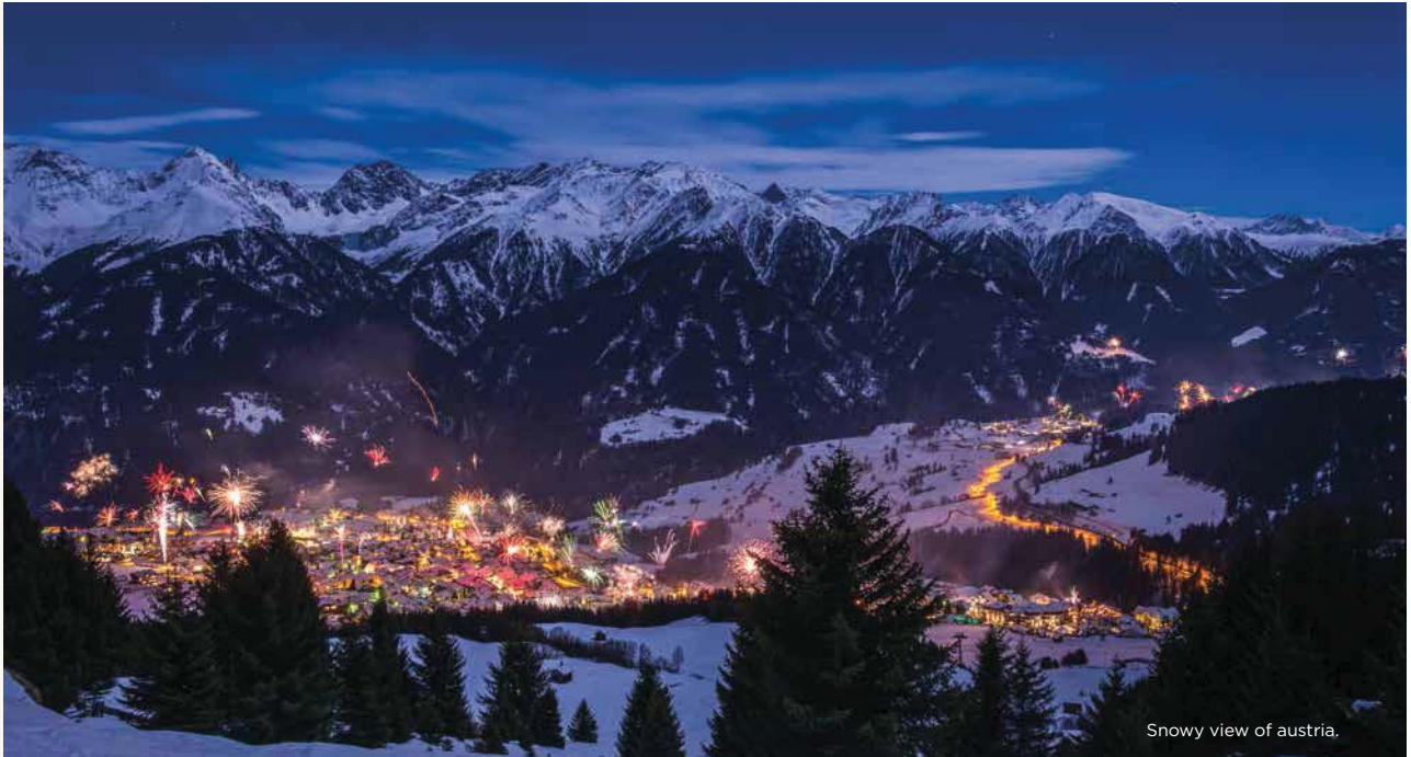
Snowy view of Austria.