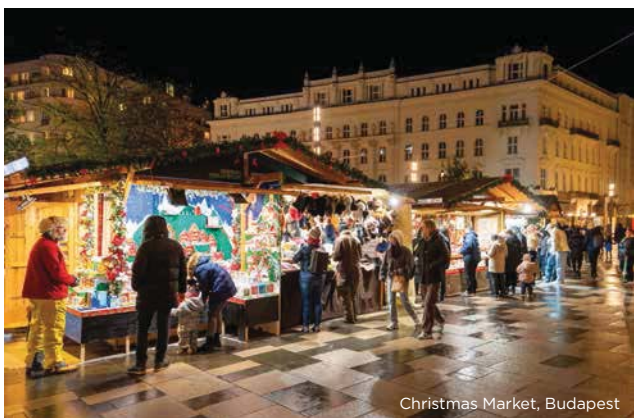
Christmas Market, Budapest

Enjoy a welcome reception dinner in the elegant surroundings of this art nouveau landmark where you can meet your fellow travellers ahead of this highly anticipated journey.